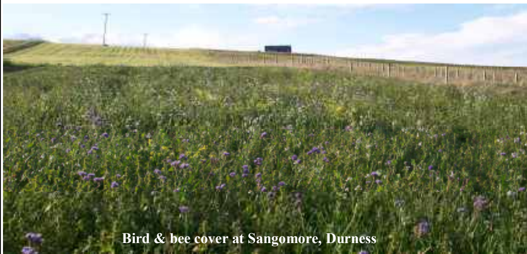
Bird & bee cover at Sangomore, Durness

cover crop. The cover crop is sown with a mix of flowering plants (like phacelia and red clover) for the bees, brassicas (like kale and fodder radish) as cover for the corn-crakes and seed producers (like mustard and linseed) for wintering finches. These areas are protected from stock and not harvested or grazed. After a three year cycle, they are ploughed in using the remainder of the crop as green manure and planted out with a permanent late maturing